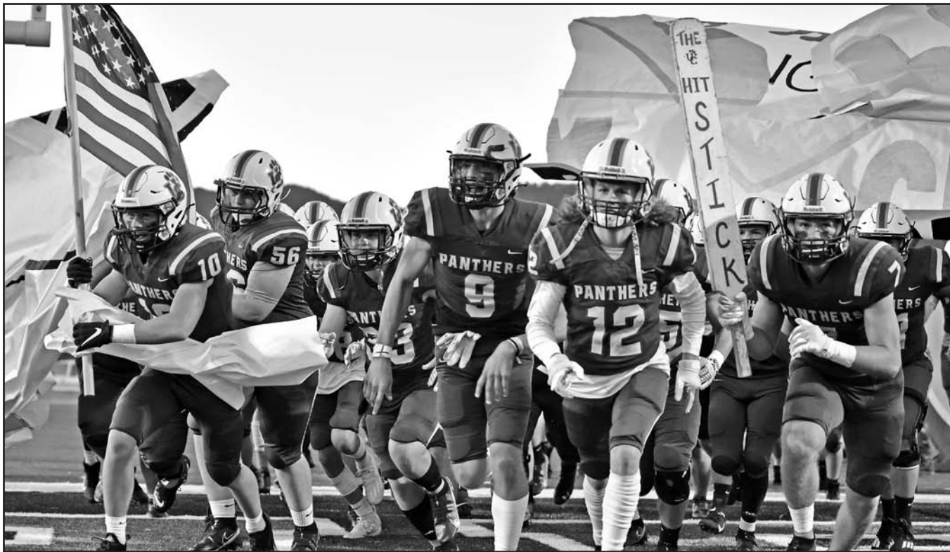
A fired-up Panthers team takes the field and immediately turned in their best half of football in 2021 vs. Murphy, NC.

Later in the fourth, the Panthers were denied on fourth down with under five minutes remaining, leading to another